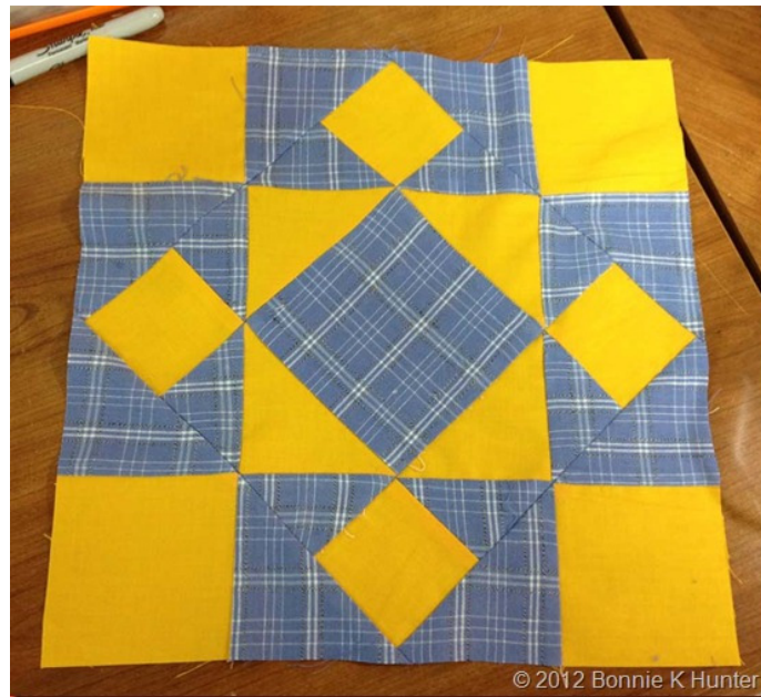
Guildford County! Tada!

Block should measure 12-1/2" at this point and finish at 12" in the quilt.